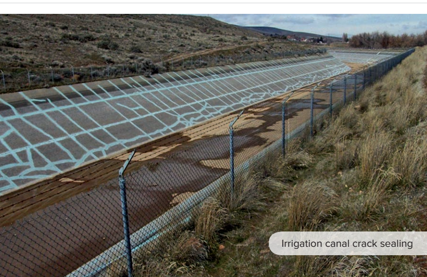
Irrigation canal crack sealing

Effectively resolves shrinkage problems normally associated with hot sprayed plural component elastomers.