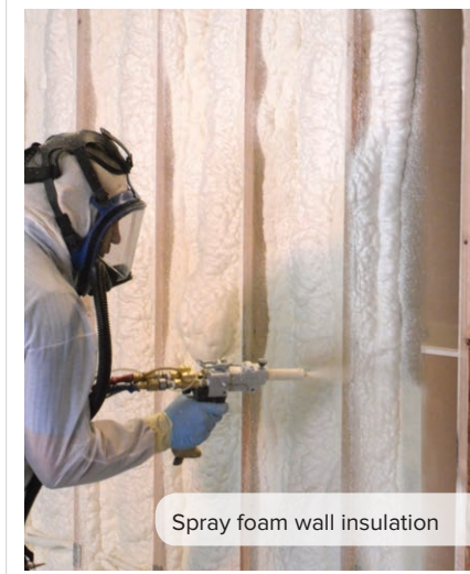
Spray foam wall insulation