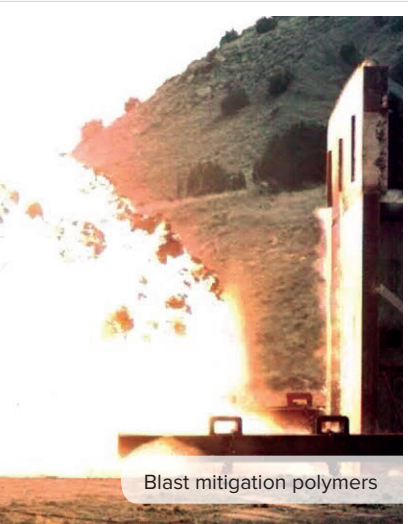
Blast mitigation polymers