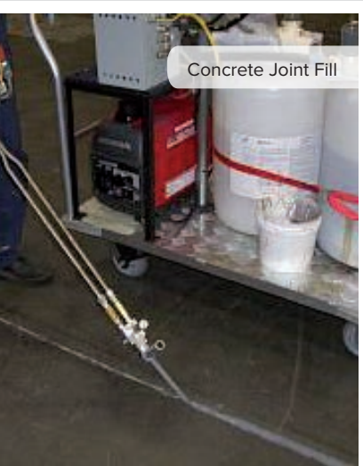
Concrete Joint Fill